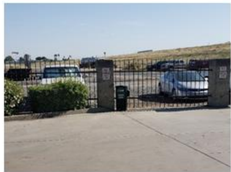
Western Milling (6)