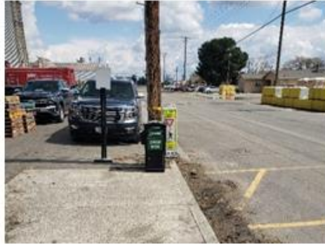
Al Gilbert - Keyes (2)