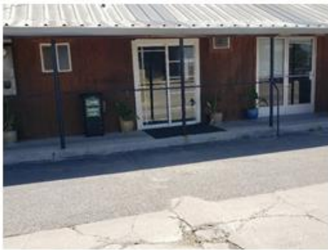
Hilmar Feed & Supply (3)