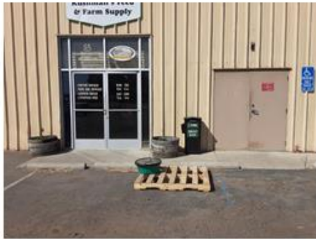
Kushman's Feed & Farm Supply (11)