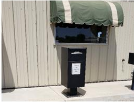
Southern Counties DHIA (9)