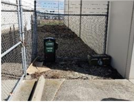
LG Seeds (1)