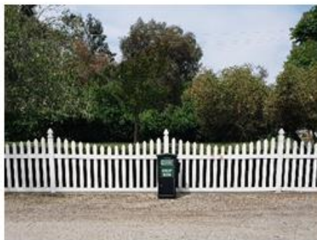
Machado Hay (7)