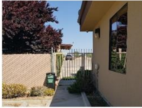
Troost Hay (10)