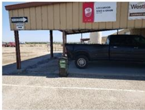
Lockwood Seed & Grain (4)